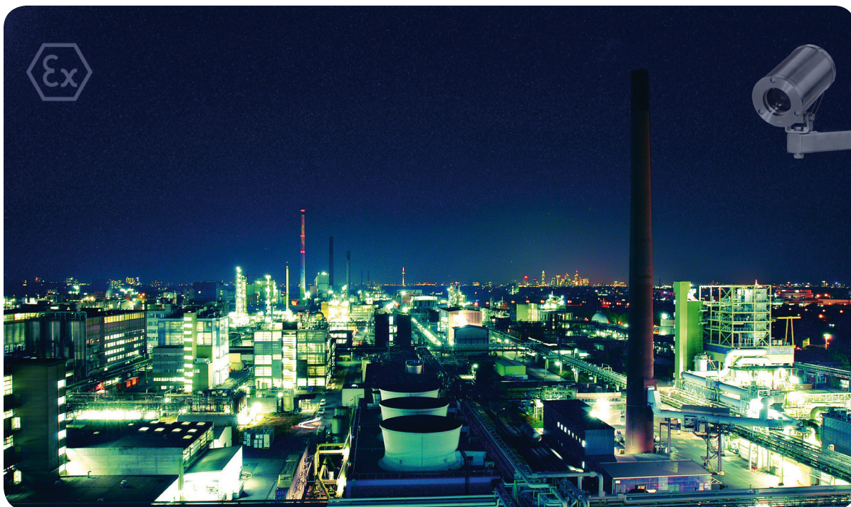
Figure 1: Industrial Park Hoechst, Frankfurt, Germany, at night.