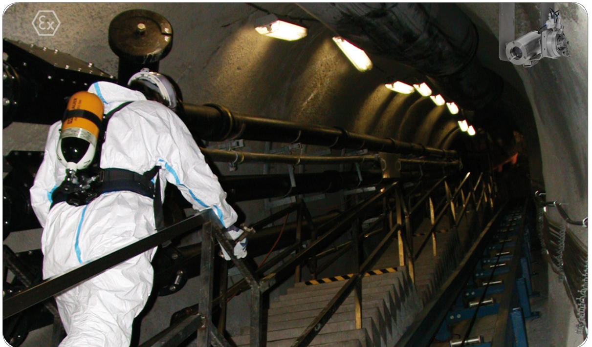
Figure 1: Ascent to the maintenance chamber „47 a neu“ in the Eleonore-tunnel. The tunnel is constantly audiovisual monitored by a supervisor from the control room.