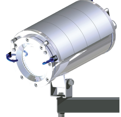
© SAMCON cool.Jacket @ RoughCam IPM114x

Color: 0.4 lux, F1.4, B/W: 0.08 lux, F1.4